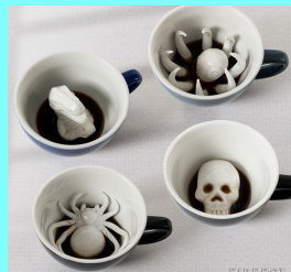
Creepy creature cups