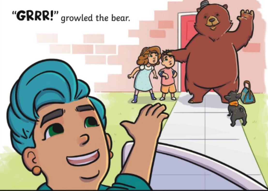
The children stood speechless, staring at their new babysitter.

"Be on your best behaviour," said Mum. "We'll be back in a few days!"